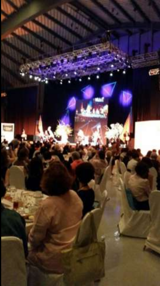
The Sayonara Banquet