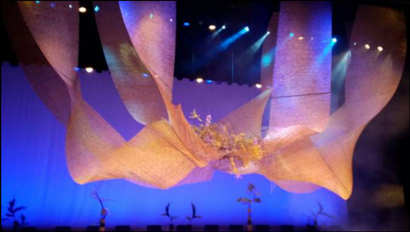
Headmaster Demonstration: Koryu