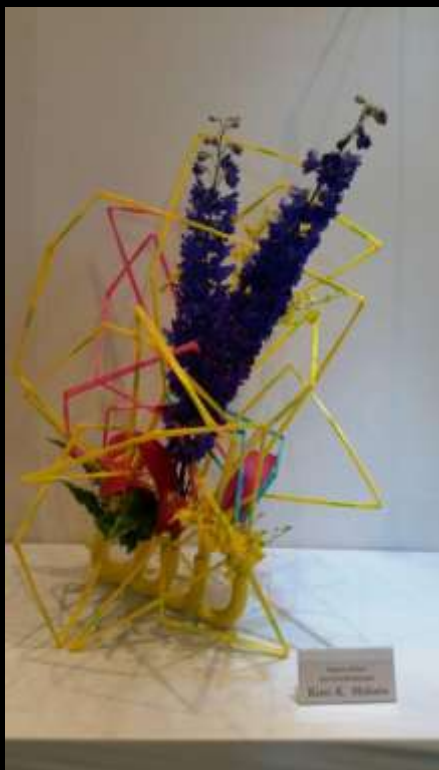
Our Member Arrangements: