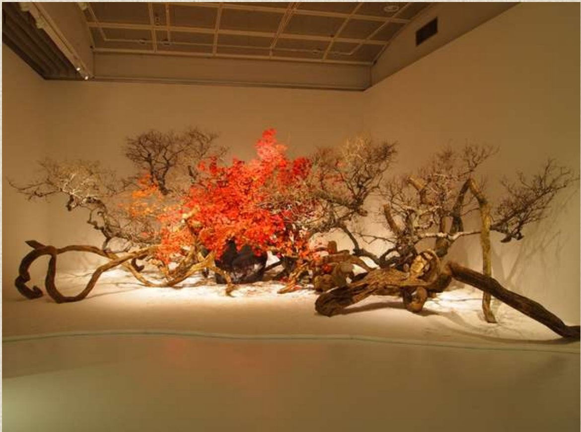
The image above is from the Sogetsu website with images of the 90th Celebration.