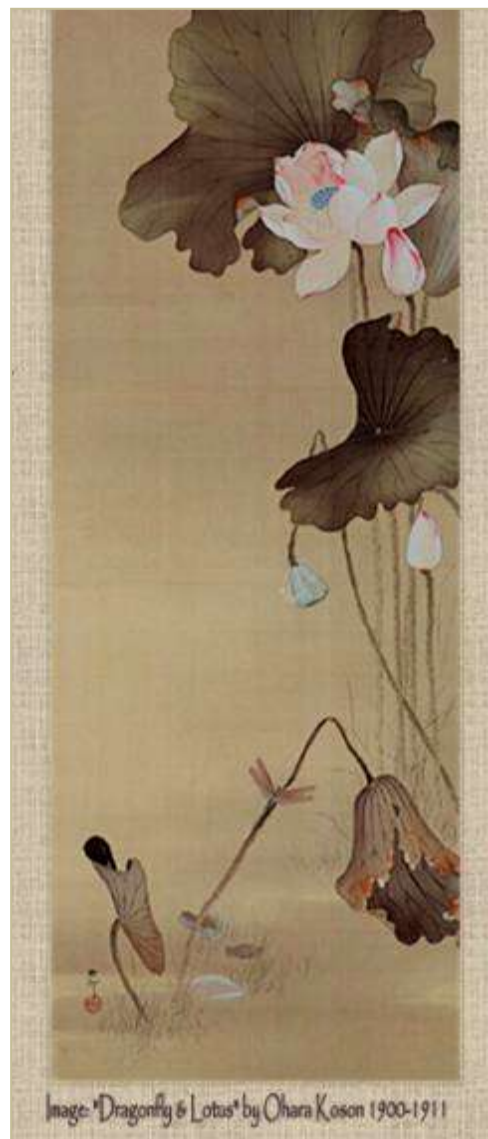
Image: "Dragonfly & Lotus" by Ohara Koson (1900-1911)

A MEMBERSHIP RENEWAL FORM is in this Newsletter. Send now, avoid penalties! Due May 31.