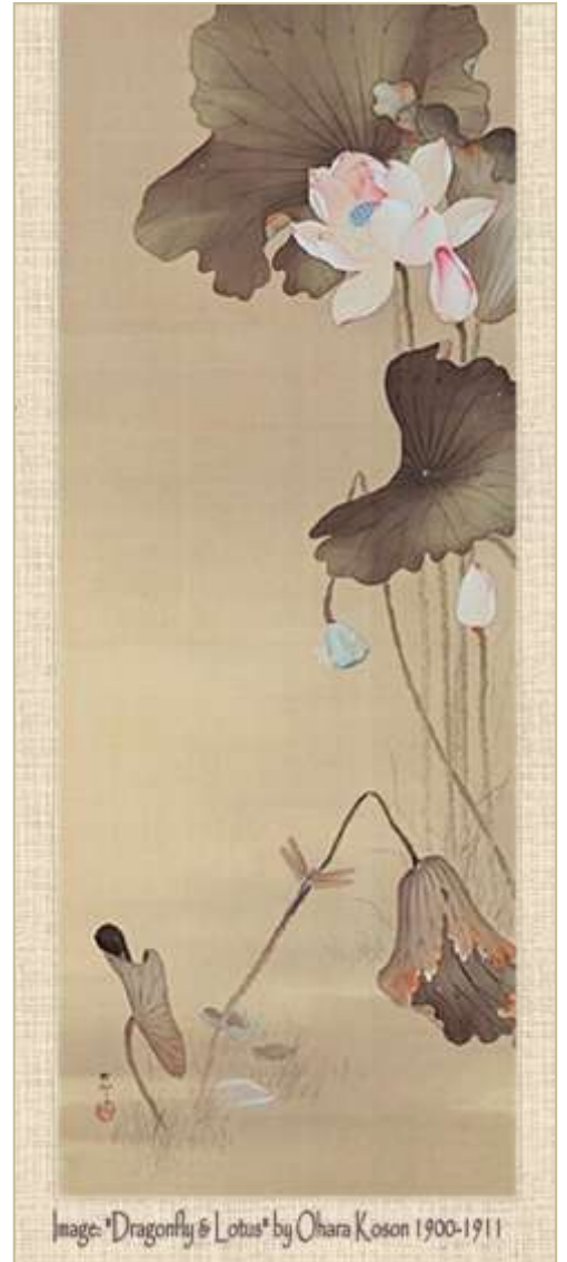
Image: "Dragonfly & Lotus" by Ohara Koson 1900-1911

Cars without the dashboard sign will be cited.