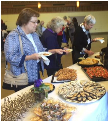
Members enjoying tea time