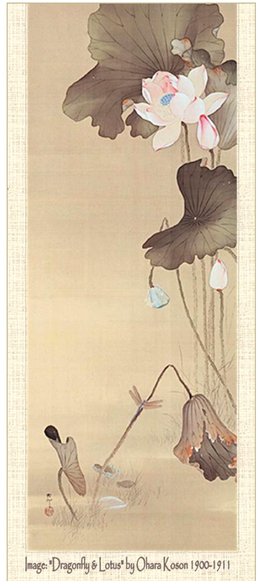
Image: "Dragonfly & Lotus" by Ohara Koson 1900-1911

Cars without the dashboard sign will be cited.