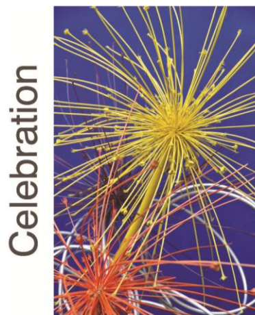
90 Years of Sogetsu Modern Design Sogetsu ArtScapes 2016 Ikebana Exhibition: Installations, Demonstrations

985 Siskiyou Drive; Menlo Park; CA 94025